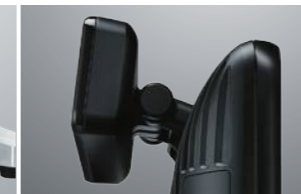
Modular Customer Display