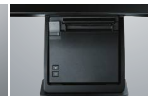
Flexibility to Integrate Receipt Printers of Your Choice