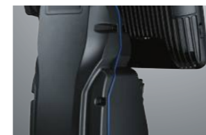
Aluminum Die-casting Back Cover for Optimal Thermal Dissipation